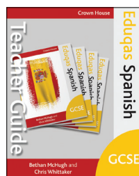
Crown House Eduqas GCSE Spanish Teacher Guide ISBN 978-178583096-9