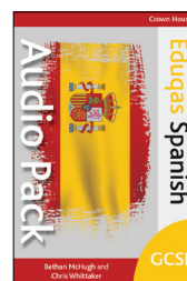
Crown House Eduqas GCSE Spanish Audio Pack (Site Licence) ISBN 978-178583164-5