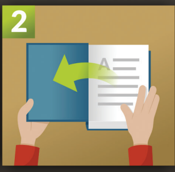
From front to back