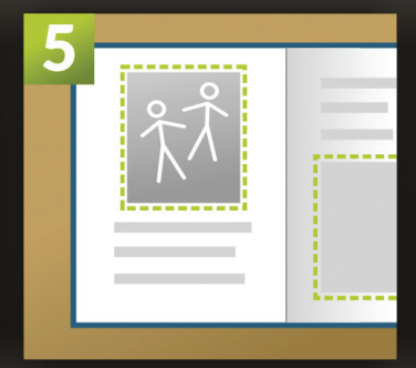
Only look at the pictures