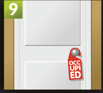
On the loo