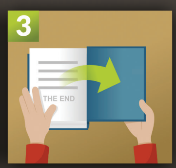
From back to front