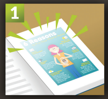
Find a graphic you like