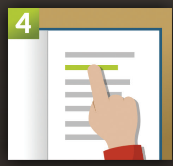
Choose a topic you like