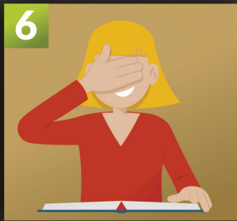
Pick a random page