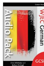
Crown House WJEC GCSE German Audio Pack (Site Licence) ISBN 978-178583165-2