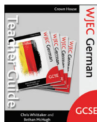
Crown House WJEC GCSE German Teacher Guide ISBN 978-178583094-5