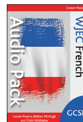
Crown House WJEC GCSE French Audio Pack (Site Licence) ISBN 978-178583176-8