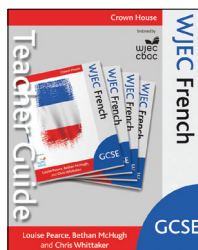
Crown House WJEC GCSE French Teacher Guide ISBN 978-178583092-1